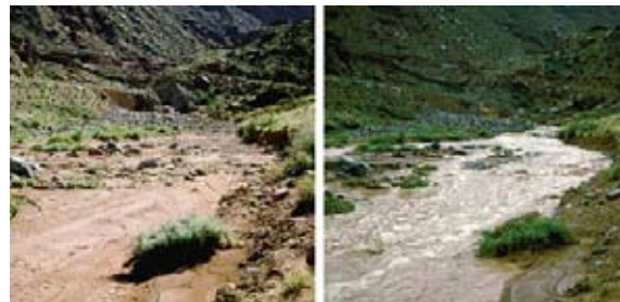
Effluent dominated waterbody dischargers are faced with meeting strict regulations.

Much effort continues to be applied to investigate the acute and chronic effects of many potential contaminants of concern. Trace metals, synthetic organics, nutrients, and unidentified toxicity are pollutants of growing significance. A range of compounds known as endocrine disruptors, which may include such diverse pollutants as pesticides, pharmaceuticals and personal care products, dioxins and furans, mercury, and polybrominated diphenyl ethers (PBDEs), may be present in wastewater at concentrations of concern.