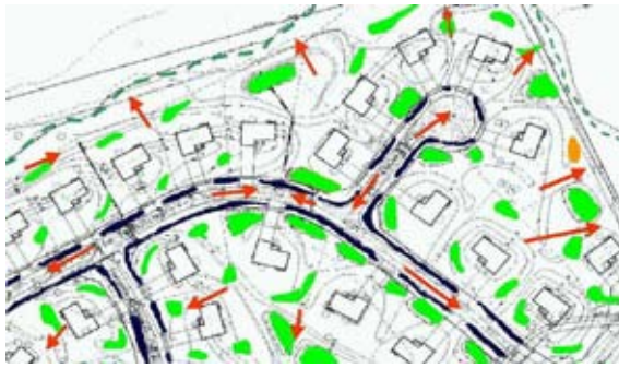
Distributed small-scale BMPs are the key to low impact development.