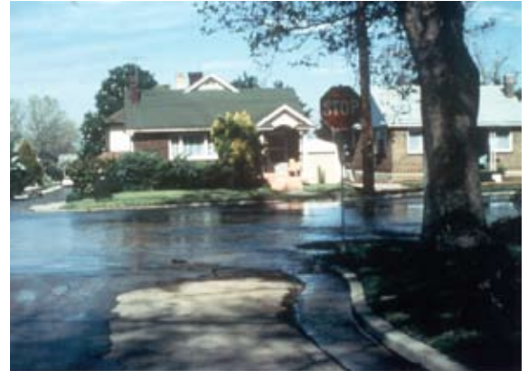
Carollo's master planning efforts for Salt Lake City eliminated storm water trouble spots throughout the city.

For the City of Salt Lake, Carollo coordinated the work efforts of the Citizen's Advisory Committee and the City Council to formulate a storm water utility. Work included developing the single-family residential equivalent service unit, providing the impervious surface area measurement for nonresidential commercial sites from aerial photographs, orchestrating the implementation of the utility with the billing cycle, and responding to site visit verifications and complaints on behalf of the city.