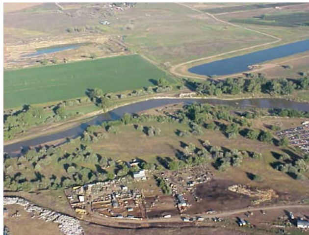
As part of a comprehensive planning study, Carollo evaluated potential sites for locating a new regional wastewater treatment facility northeast of Denver.

consent for the new plant as part of the process selection process. It will also be necessary to evaluate biosolids treatment and disposal at the treatment plant site.