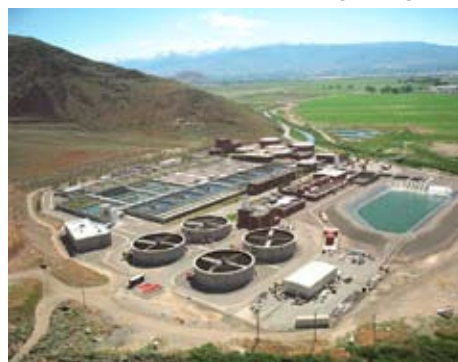
The Reno Master Plan provides a road map for improving performance of existing facilities at the Truckee Meadows Water Reclamation Facility and the South Truckee Meadows Wastewater Treatment Facility.