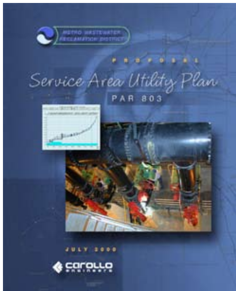
The Service Area Utility Plan for the Metro Wastewater Reclamation District addresses 43 gravity interceptor sewers, four lift stations, four force mains, 65 primary metering facilities, 41 diversion structures, and approximately 3,750 manholes.