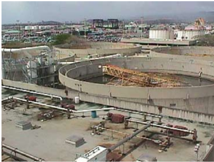
Carollo prepared the Engineer's Report for the bond issue to finance a comprehensive 20-year CIP for Honolulu's wastewater facilities.

The Engineer's Report includes a detailed financial analysis of projected operation and maintenance costs, capital costs, service charges, financing schedules, debt payments, reserve fund levels, and debt coverage ratios. The report identified and evaluated approximately $2 billion in capital facilities as to project timing, impact on cash flow requirements, and regulatory requirements. Projects planned include collection system improvements/expansion, water reuse and distribution, headworks and primary treatment, secondary treatment, and solids handling and disposal.