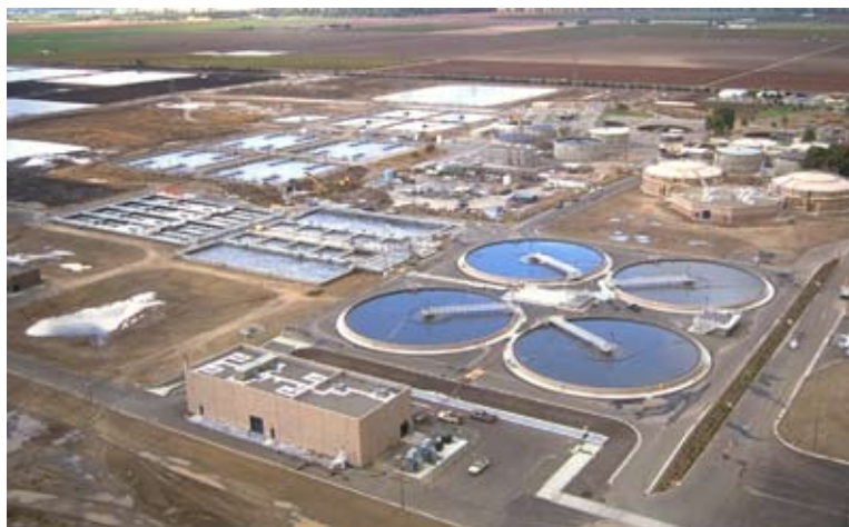
The Fresno-Clovis Regional Wastewater Reclamation Facilities Master Plan addressed wastewater management needs through a 25-year planning period which will more than double the current flow and load to the treatment facilities.