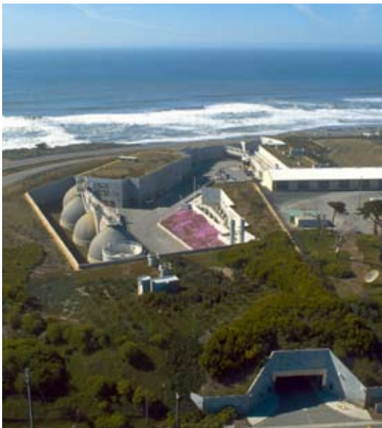
San Francisco's Sewer Master Plan involves an analysis of sea level rise in order to evaluate the potential impacts to the city's combined sewer system.