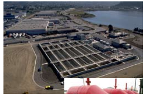
The 100-mgd Point Isabel Treatment Plant was one of the country's first remote wet weather treatment plants.