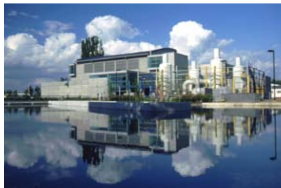
The $26 million influent pump station and headworks is the cornerstone of Portland's planned CSO projects. The 300-mgd facility is quiet and odor free, as well as an attractive addition to the neighborhood.

Our engineers have applied CSO management practices; designed wet weather treatment, transport and storage facilities; developed rehabilitation programs; and helped implement green solutions for a variety of clients.