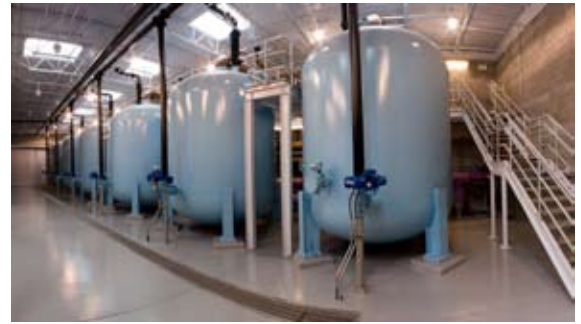
Carollo and the Magna Water District completed two applied research studies to evaluate the efficacy of the BIOBROx™ system for removing perchlorate from membrane concentrate.

The associated required reactor volume would be a small fraction of the volume required by "conventional" biological residuals treatment systems, and no consumables would be required.