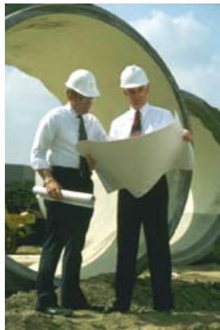
Carollo's Infrastructure Group helps clients develop solutions for today's complex water, wastewater, and storm water infrastructure challenges.

Carollo Engineers' Infrastructure Group offers complete engineering services for the complex infrastructure challenges facing water, wastewater, and storm water utilities today. We provide complete program management, design, rehabilitation/replacement, and construction services for pipelines, pump stations, and storage facilities. Our services also include water, wastewater, and storm water system master planning; hydraulic modeling; geographic information system (GIS) mapping; sanitary sewer overflow (SSO) and combined sewer overflow (CSO) elimination programs; asset management services; permitting and regulatory assistance; and public relations programs.