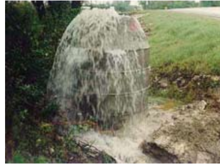
cMOM focuses on sewer collection systems with a goal of eliminating sewer overflows.

The Clean Water Act (CWA) of 1972 prohibits spills to waters of the United States. The proposed SSO rule enforces the same, but requires additional reporting of spills no matter where they occur, including sewer backups into buildings.