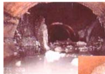
Knowing the condition of a collection system is integral to meeting SSO regulations.